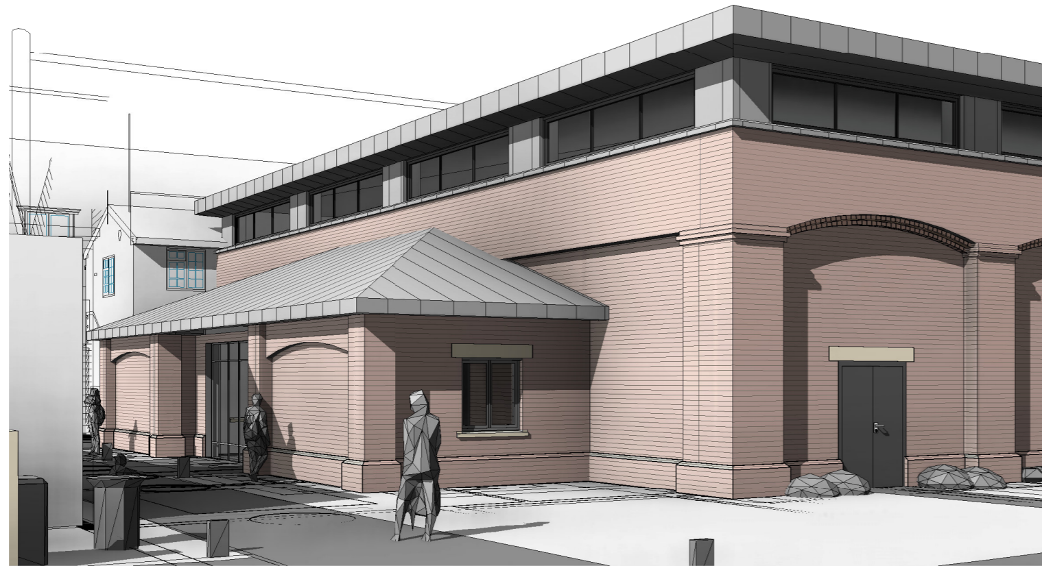
View of Historical Columns