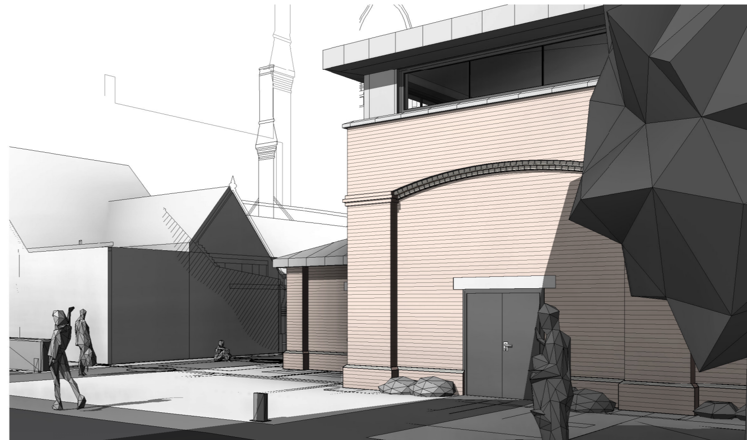
View of new entrance